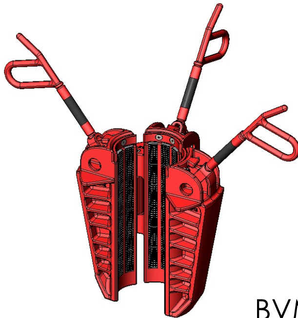
SDXL 5" SLIP BODY SHOWN

BVM CORPORATION 430 S. NAVAJO STREET, DENVER CO 80223 PHONE: 303-975-1402; FAX: 303-975-0981 www.bvmcorp.com; sales@bvmcorp.com